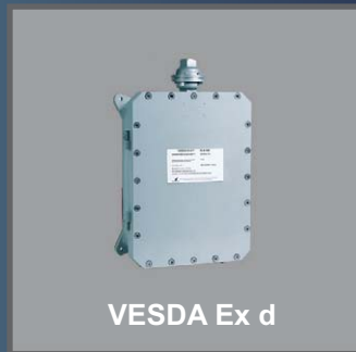
VESDA Ex d