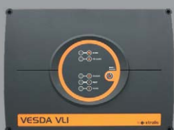
Industrial VESDA VLI