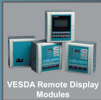
VESDA Remote Display Modules